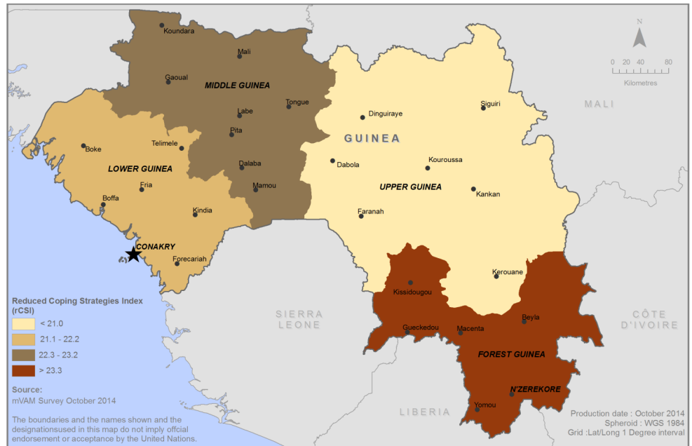
Map 1: Guinea – High Coping Strategies Observed in Guinea in October 2014

October data for Guinea suggests that the rCSI is high in Forest Guinea (rCSI=23.5), indicating greater food insecurity in this zone compared to the rest of the country. The rCSI is particularly high in Macenta prefecture in the Nzerekore region, a zone that has been hard hit by the epidemic. Unfortunately, the limited number of responses received from Macenta does not permit us to draw more precise conclusions.