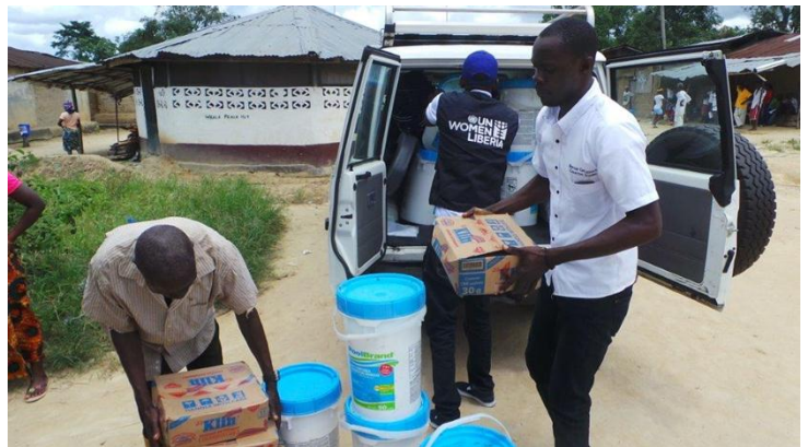
UNWomen staff distributing Ebola prevention hygiene materials in Weala and Schefflin.