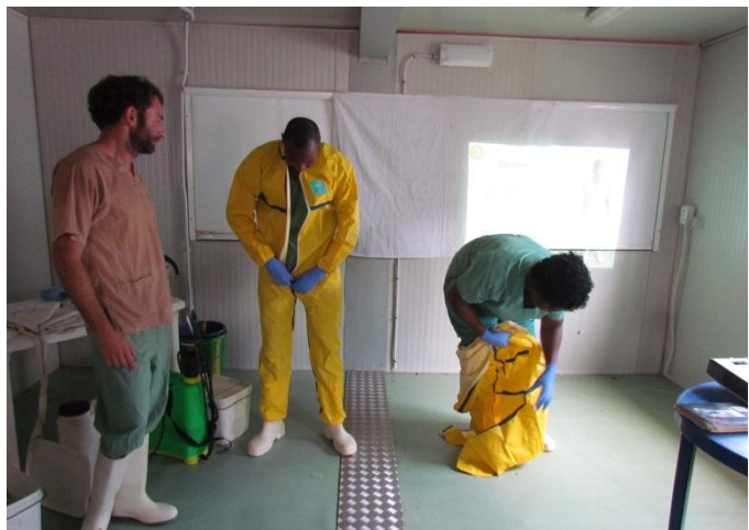
Conakry, Guinea. MSF hosts safety training at Nongo Ebola Treatment Center, a permanent health center built by WFP and managed by MSF.