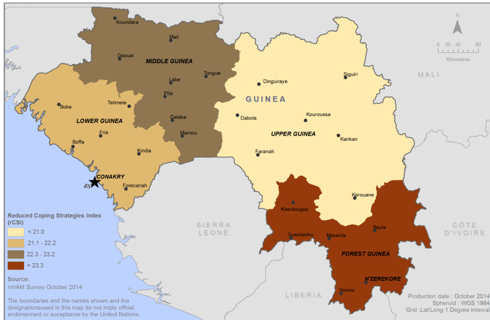
Map 1: Guinea - High Coping Strategies Observed in Guinea in October 2014

October data for Guinea suggests that the rCSI is high in Forest Guinea (rCSI=23.5), indicating greater food insecurity in this zone compared to the rest of the country. The rCSI is particularly high in Macenta prefecture in the Nzerekore region, a zone that has been hard hit by the epidemic. Unfortunately, the limited number of responses received from Macenta does not permit us to draw more precise conclusions.